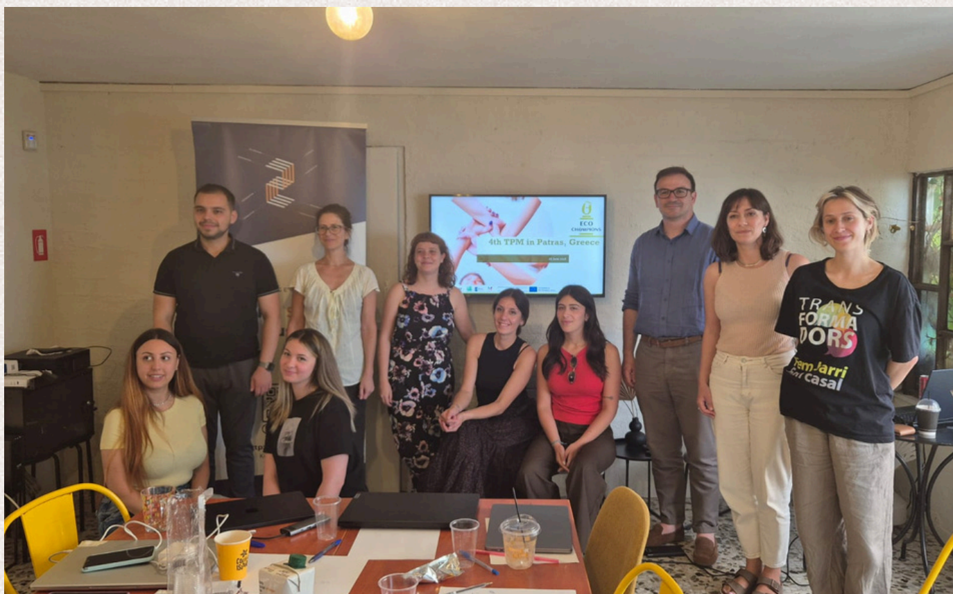
ECO-CHAMPIONS partners during the TPM in Patras, Greece.

The first day focused on the Transnational Project Meeting, where partners reviewed progress since the previous TPM, discussed the Eco-Festival results, the petition campaign, KPIs, badge award design, the large-scale online event, project video, final event planning, and transnational recommendations on waste management. The Balkan Forum contributed to the session on internal and external evaluation, supporting the project's final implementation and reporting process.