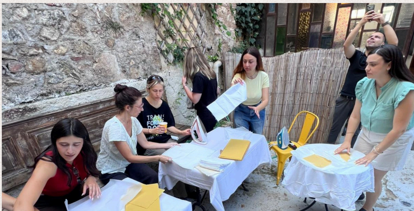
DIY Activity - Patras/Greece

Overall, this activity supported the Eco-Champions project by promoting practical environmental education, citizen engagement, and everyday actions that contribute to waste reduction and a more sustainable lifestyle.