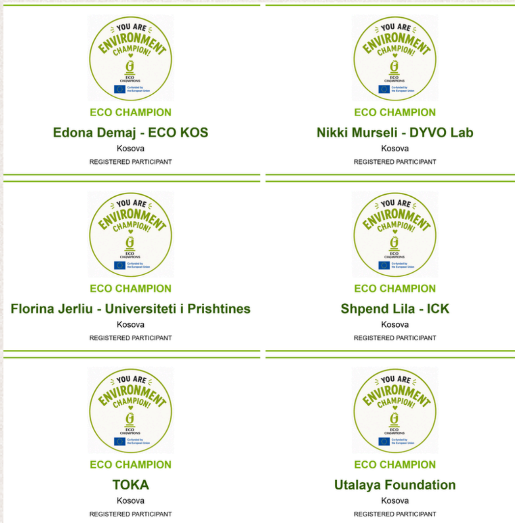
Examples of Eco-Badges of some of the generated for selected stakeholders

The initiative received very positive feedback from stakeholders, many of whom appreciated the recognition and welcomed the approach. Some recipients also shared the Eco-Badge on their own social media channels, helping to increase the visibility of the ECO-CHAMPIONS project and further promote environmental awareness, sustainable practices, and community engagement.