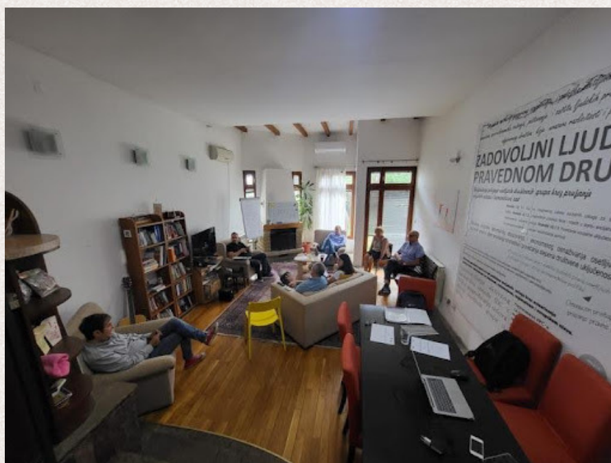
2025-07-28_ Pact for Growth Project Kickoff meeting held on July 28-29 in Belgrade.

Looking ahead, the next major project milestone is a regional training event scheduled to take place in Ohrid from September 9–12, where three representatives from each partner organization will participate in capacity-building sessions focused on monitoring mechanisms, advocacy strategies, and the integration of social policy priorities into the EU Growth Plan framework.